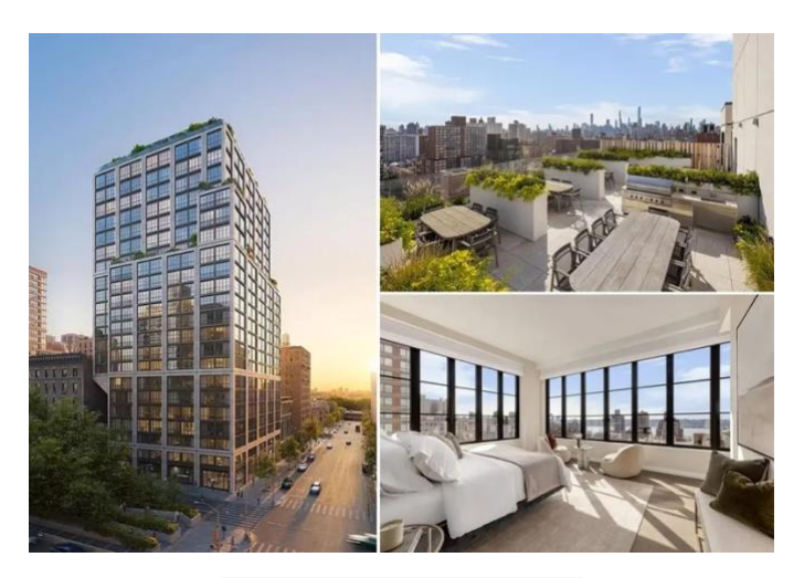
96+ Broadway (Compass)