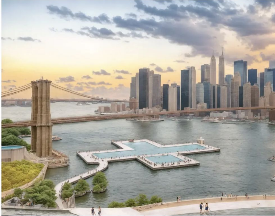
+POOL (Designed by Family New York & Playlab, Inc.)