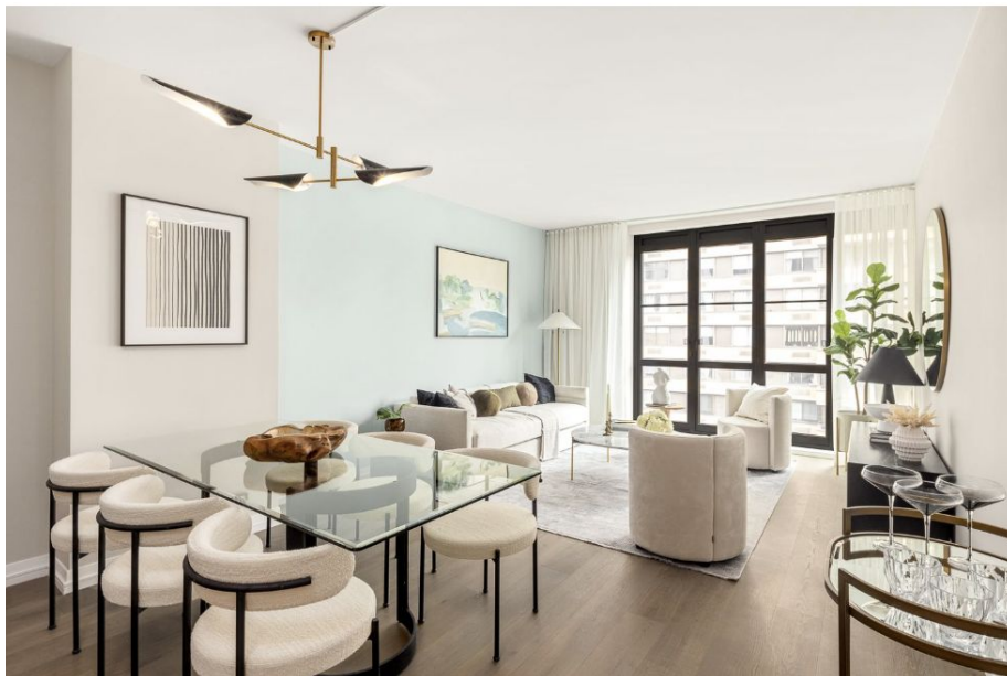
96+Broadway, #5G (Compass)

Broadway Corridor | Condominium | 2 Bedrooms, 2.5 Baths | 1,223 ft 2