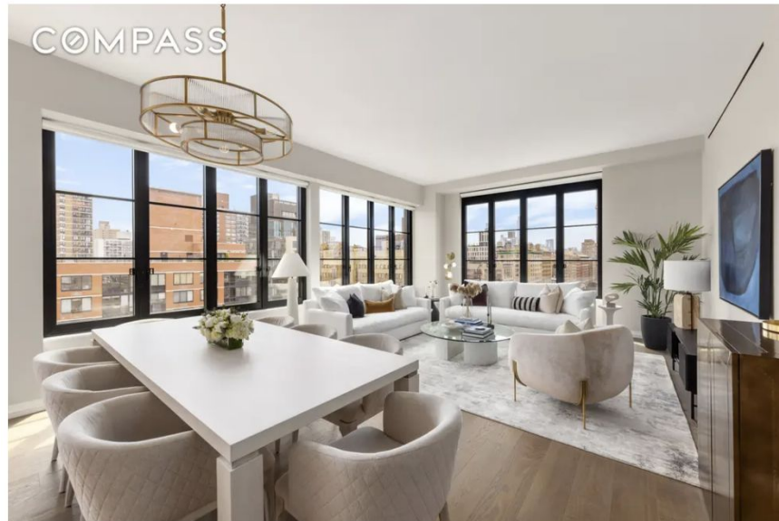
96+Broadway, #17D (Compass)

Broadway Corridor | Condominium | 3 Bedrooms, 3.5 Baths | 2,221 ft 2