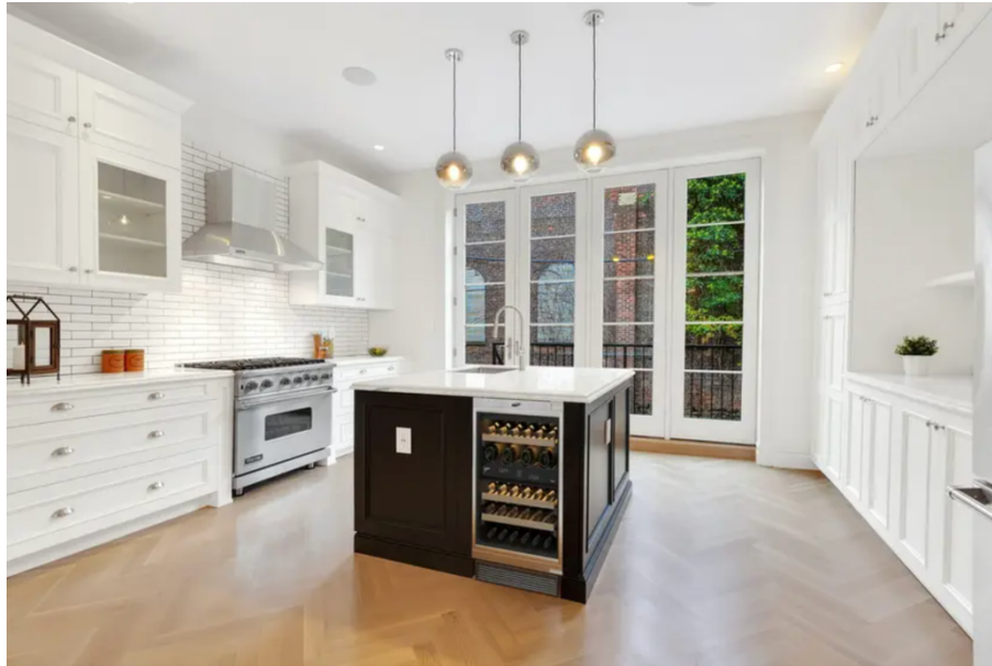
Kitchen with undercounter wine fridge

After navigating the quirks of New York City’s real estate market and closing the deal, buyers can finally begin to settle into the rhythms of their new neighborhood and city life. That means everything from mastering the subway to discovering local dining and entertainment spots.