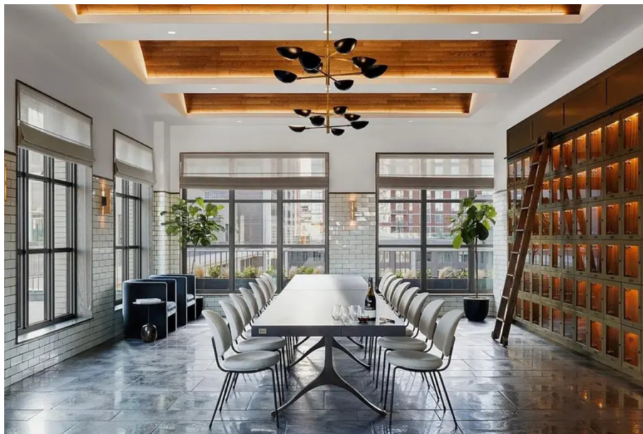
Front & York residents have a shared amenity wine room, with private wine lockers

Wherever one buys wine, proper storage is key for optimal enjoyment. In recognition of this, several residential developers and designers seek to make wine storage as easy as possible. Some buildings offer dedicated, temperature-controlled wine storage as part of their amenity packages, while others have gone one step further such as amenity wine tasting rooms and cellars.