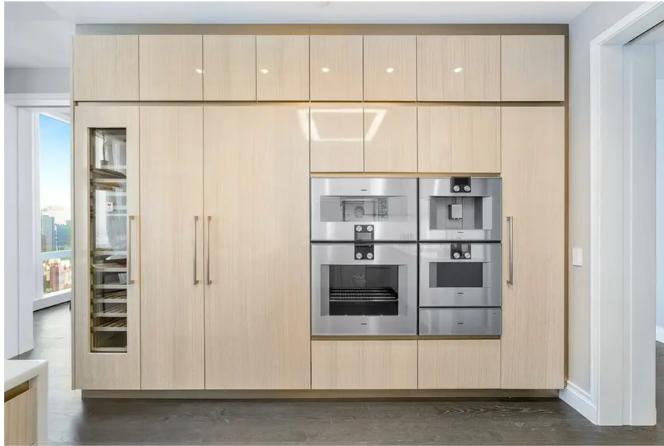
Integrated wine fridge at 35 Hudson Yards

Beyond function, wine refrigerators lend a touch of quiet luxury to a kitchen—especially when matched with other high-end appliances from names like Sub-Zero , Miele , and Marvel . They also enhance convenience: when entertaining, it's far easier to access a kitchen fridge than to retrieve a bottle from a building's communal wine cellar. And for those who don't drink wine, these fridges are surprisingly versatile. According to Wine & More , they're ideal for storing cheese, charcuterie, chocolate, or even skincare products.