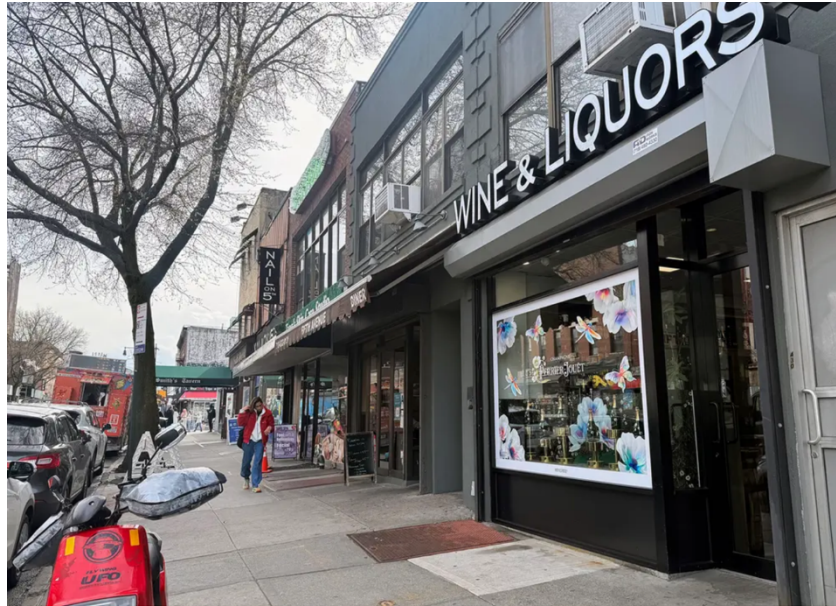
Wine store on 5th Avenue in Park Slope

Regardless of where one buys wine, proper storage is key to optimal enjoyment. Recognizing this, many residential developers and designers are incorporating wine storage into their offerings. Some buildings provide temperature-controlled wine rooms as part of the amenity package, while others are going a step further.