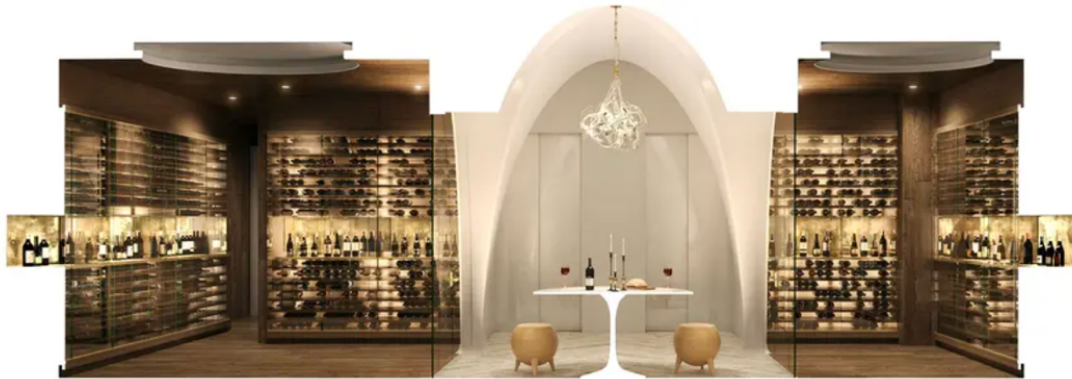
Residents' wine room and wine cellar at 180 East 88th Street

In regards to in-unit storage options, undercounter wine fridges can cost as little as a few hundred dollars, however, proper installation in a multi-family apartment building involves careful consideration of space, electrical requirements, and noise—factors that become even more complex when neighboring units are involved . As a result, some designers are choosing to integrate wine refrigerators into kitchens during construction, treating them as essential appliances rather than optional add-ons.