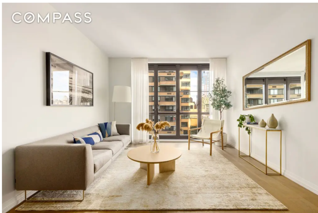
96+Broadway, #10B (Compass)

Broadway Corridor | Condominium | 2 Bedrooms, 2 Baths | 1,281 ft 2