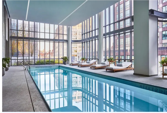
565 Broome Soho (Douglas Elliman)