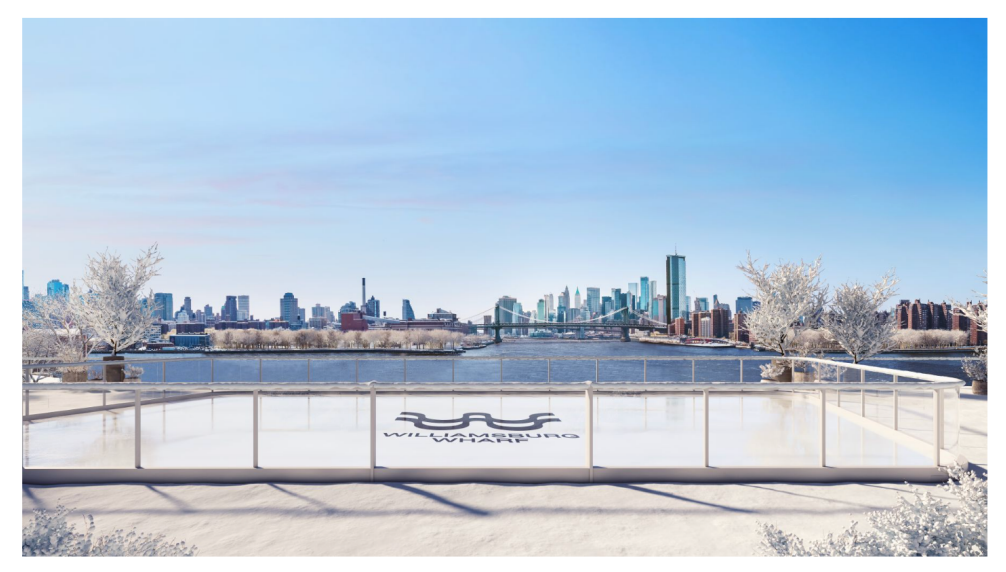
One Williamsburg Wharf

For an innovative winter twist, <u>One Williamsburg Wharf</u> in Brooklyn has introduced New York's first private outdoor ice skating rink. Situated on a rooftop terrace, this unique amenity showcases breathtaking views of the Manhattan skyline and East River.